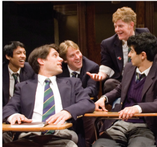
THE HISTORY BOYS 2009