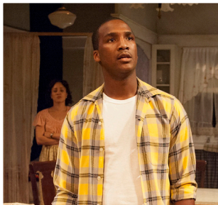
A RAISIN IN THE SUN 2013