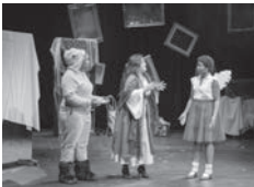
Members of the TimeLine South Ensemble perform their original work SHATTERED in 2025.

T imeLine South—a unique arts program that provides teens a safe space for self-expression, creativity, and ensemble building on the south side of Chicago—just celebrated its 8th anniversary in 2025, and four years in partnership with the Reva and David Logan Center for the Arts. Offered free of charge for six weeks during the summer, TimeLine South promotes leadership in the arts and introduces teens to the idea that theatre can also be a vehicle for social justice.