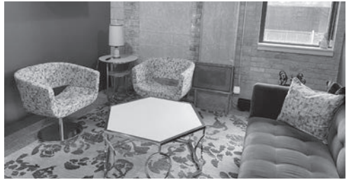
Pictured (clockwise from left): Rendering of TimeLine new home and vertical blade sign at night (HGA); 4th floor History Hallway with named show posters (Ashley Hamm Photography); and the backstage Artist Lounge adjacent to dressing rooms.