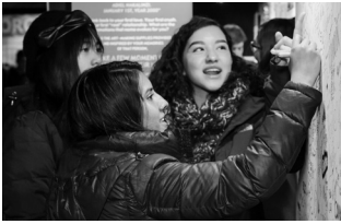
Living History students in the lobby at a matinee performance of CARDBOARD PIANO, 2019.

L earning and discovery have always been central to TimeLine's mission, driven by our belief that live performance can connect people and illuminate ideas.