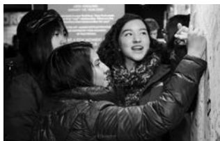
Living History students in the lobby at a matinee performance of CARDBOARD PIANO, 2019.

Learning and discovery have always been central to TimeLine's mission, driven by our belief that live performance can connect people and illuminate ideas.