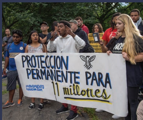
New York City rally in support of DACA, 2017.

Deferred Action for Childhood Arrivals (DACA) was implemented in 2012 by the Obama administration. In 2017, Trump announced during his first term as president that he would be ending DACA. While existing recipients of DACA were still able to renew every two years, those not already on DACA before 2017 are now unable to apply.