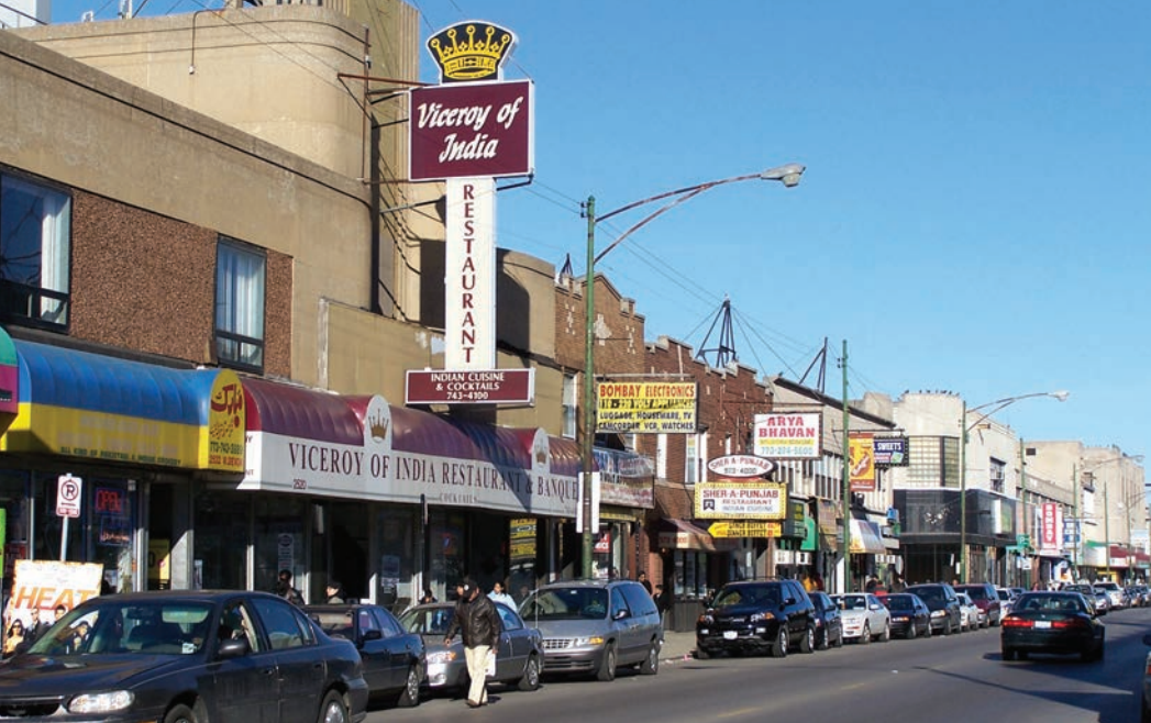
A stretch of Chicago's Devon Avenue, an area known as "Little India," circa 2006.