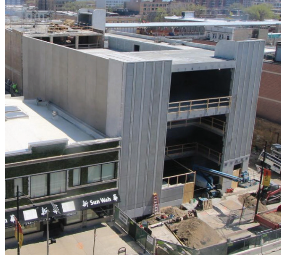
TimeLine's new home (pictured in May), currently under construction at 5035 N. Broadway in Chicago's Uptown neighborhood and anticipated to open in Spring 2026. Learn more about the project on page 14 of this Backstory magazine and at timelinetheatre.com/its-time .

"We mustn't forget the histories and struggles, the achievements and injustices, the overcoming of odds and the societal hurdles that continue to shape our culture."