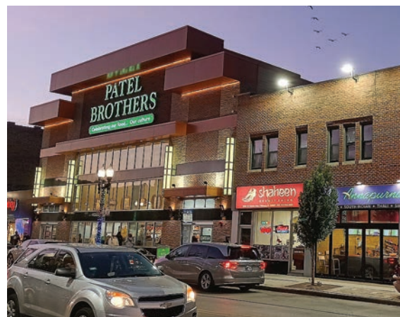
The flagship store of the Indian-American grocery store chain Patel Brothers, now with dozens of locations nationwide, founded on Devon Avenue more than 50 years ago.

weekly newspaper, began publication in 1977. The Indo-American Center opened in West Ridge in 1990 to assist recent immigrants arriving in the community. By the year 2000, more than 15,000 Asian residents called West Ridge home, the majority of them South Asians. Sections of Devon Avenue were given honorary names to reflect the new community; signs for "Muhammad Ali Jinnah Way," "Sheikh Mujib Way" and "Gandhi Marg" now line the street.