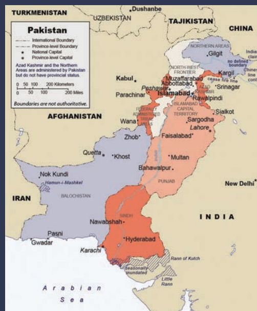
A map of Pakistan, Sindh in the burnt orange.

1977 India Tribune begins publication in Chicago.