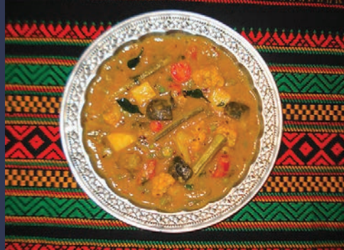
A plate of Sindhi Kadhi.

When the British decided to leave India and partition it into the Hindu-majority India and Muslim-majority Pakistan, they placed a man named Sir Cyril Radcliffe in charge of the Boundary Commission tasked with dividing up the country. Radcliffe had never been to India—in fact, he had never even left Europe.