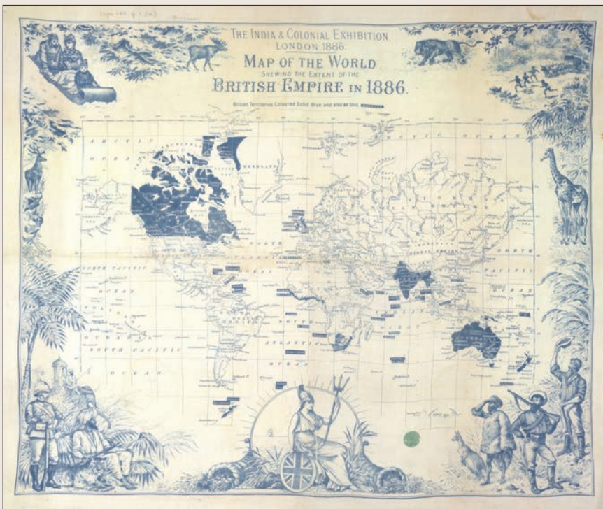
Map showing the extent of the British Empire in 1886.