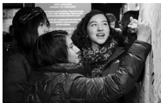
Living History students in the lobby at a matinee performance of CARDBOARD PIANO, 2019.

Learning and discovery have always been central to TimeLine's mission, driven by our belief that live performance can connect people and illuminate ideas.