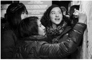
Living History students in the lobby at a matinee performance of CARDBOARD PIANO, 2019.

Learning and discovery have always been central to TimeLine's mission, driven by our belief that live performance can connect people and illuminate ideas.